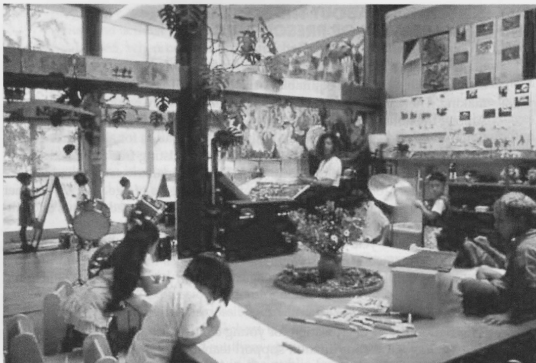
Figure 2.2. The Diana School atelier .

atelier . In his words that follow, we can directly see how his language is rich, complex, and dense; it is poetic as well and thus invites careful reflection because it offers many layers of meaning.