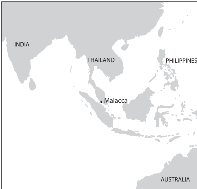
FIGURE 1.2. Malacca.

out the Portuguese Empire) could store food, merchants' goods, and provisions for Portuguese ships, and when they could be relieved by supplies and forces brought in by sea, they were virtually impregnable. In 1568, for example, the fort in Malacca withstood a siege by a Muslim amphibious force that outnumbered the Portuguese and their allies 10 to 1. 14