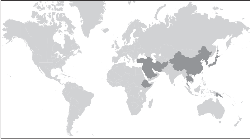
FIGURE 1.1. In dark gray: areas never under European control, 1914. In light gray: territory Europeans controlled or had conquered by 1914, including colonies that had gained independence. Adapted from Fieldhouse 1973, map 9.

would soon stabilize after a period of turmoil, allowing agriculture to advance and trade in tea, silk, and porcelain to flourish. Western Europeans, by contrast, had nothing that promising on the horizon—only continued raids by marauding Vikings. 3