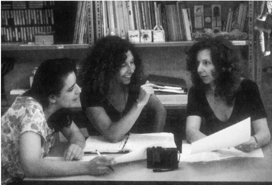
The pair of teachers meeting with the atelierista at Diana Preschool.

It seems clear that professional early childhood teachers, no matter their setting or society, agree on their basic range of responsibilities. Yet they do not think alike about these responsibilities: how they prioritize them, turn them into concrete tasks, and talk about the reasons for what they do. When asked to define the role of the teacher, for example, Reggio educators do not begin in the way typical to