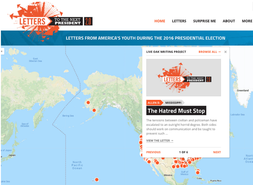
Figure 1. A screenshot of letters2president.org.