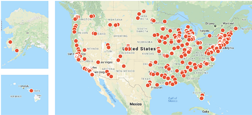
Figure 2. Map of participating sites.

To be able to make sense of the many topics students wrote about, we consolidated the thematic “tags” that students had applied to their letters. The submission system required students to manually enter all “tags” (relevant topic keywords) for their letters, entering up to five tags per letter; the system did not provide a menu list of common issues for students to choose from. Due to this open-entry system, students generated a total of 1,636 different issue tags, including a large proportion of redundant and related tags (e.g., tags included “animal lives matter,” “animal life matters,” “animal life,” “animal rights,” “animal lives,” “animal cruelty,” “animal treatment,” and many others that suggested similar themes). We developed a scheme to code the tags and consolidate them into 69 distinct, nonoverlapping topic categories, clustering tags that were thematically related and/or redundant in order to allow us to feasibly conduct analyses based on broader topics (see Table 2).