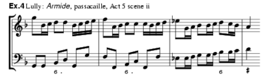
Ex.4 Lully: Armide, passacaille, Act 5 scene ii

Modern discussions of inequality often list additional contra-indications which are either based on a single, sometimes dubious source or are outright fabrications: the presence of syncopated notes (Lacassagne, 1766, as reported in Borrel, 1934); the presence of rests of the same value as the notes in question (Borrel); the fact that the notes are in an accompanying part (Emy de l'Ilette, c 1810, as reported in Borrel); allemandes (Dolmetsch's misreading of the sources, 1915); repeated notes, slurs over more than two notes, and motion that is too fast (Quantz, 1752, as reported by Borrel and others); motion that is too slow (Saint Lambert, 1702, as reported by Donington, 3/1974). None of these has the force of a rule and most are refuted by sources. Only the long slur seems at times to be intended to cancel pairing and to suggest to the player that only the first note should be emphasized.