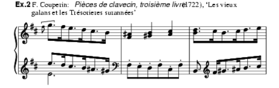
Ex.2 F. Couperin: Pièces de clavecin, troisième livre (1722), 'Les vieux galans et les Trésorieres suranées'