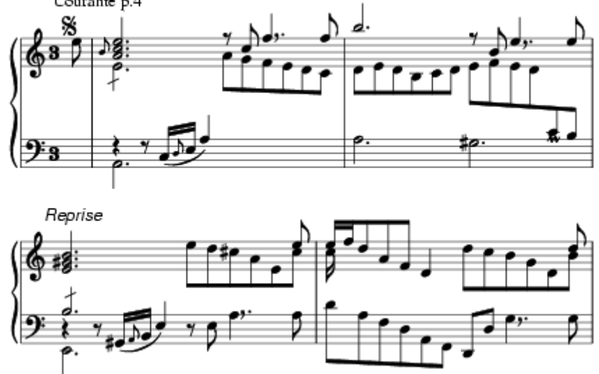
Ex.3 Rameau: Nouvelles suites de pièces de clavec(Baris, cl728), Courante p.4