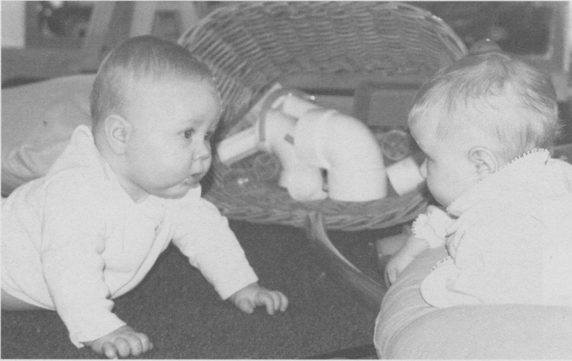
FIGURE 16. Children are inherently social at the earliest of ages.