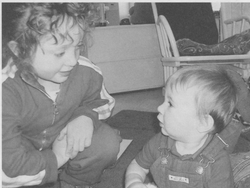
FIGURE 1.5. Teachers invited 3-year-old children into the infant classroom to play, observe, and reflect on infants' rights.

what food is packed in your lunch make you feel and why?" Most children did not currently have input into the content of their lunches, but wanted input, and gave answers that suggested they would make responsible choices. One girl who said she would choose to pack fruit noted, "Big apples make you bigger because they are healthy."