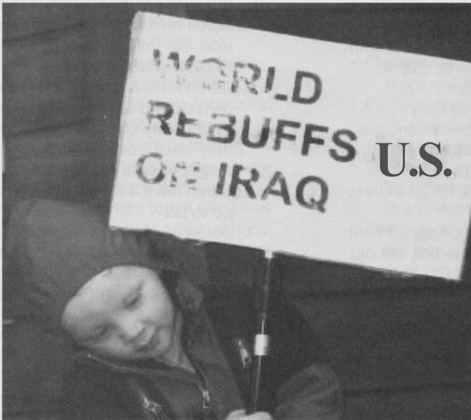
FIGURE 1.1 A 4-year-old child demonstrating with his parents against the war in Iraq.

At Boulder Journey School, efforts to understand how young children think about children's rights began in earnest in early 2003. Shortly after the United States began its military campaign in Iraq, a 4-year-old boy who demonstrated with his parents against the war carried a protest sign into his class at Boulder Journey School and declared, "1, 2, 3, 4 . . . we don't want your muddy war." The sign