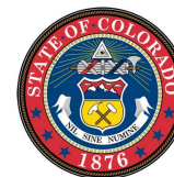
Colorado Office of the Child's Representative